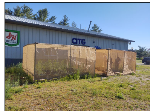
Mass rearing cage Three Lakes, Oneida County